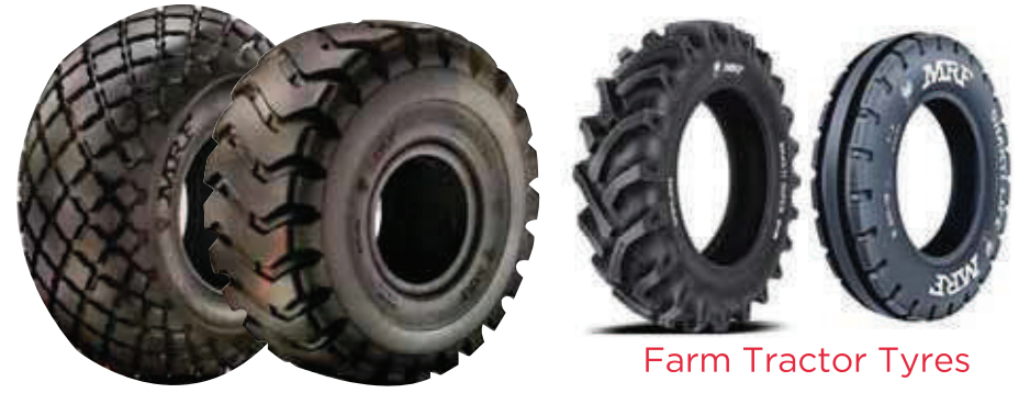
Off the Road Tyres

MRF (Madras Rubber Factory) is an Indian multinational and the largest manufacturer of tyres in India and the fourteenth largest in the world. It has a manufacturing range of from motorcycle tyres to fighter jet ones. An enterprise that started as a toy balloon maker in 1946 in South India quickly grew to become one of India's biggest and respected companies. Renowned for product superiority and innovation, MRF continues to be the leading tyre-maker in India.